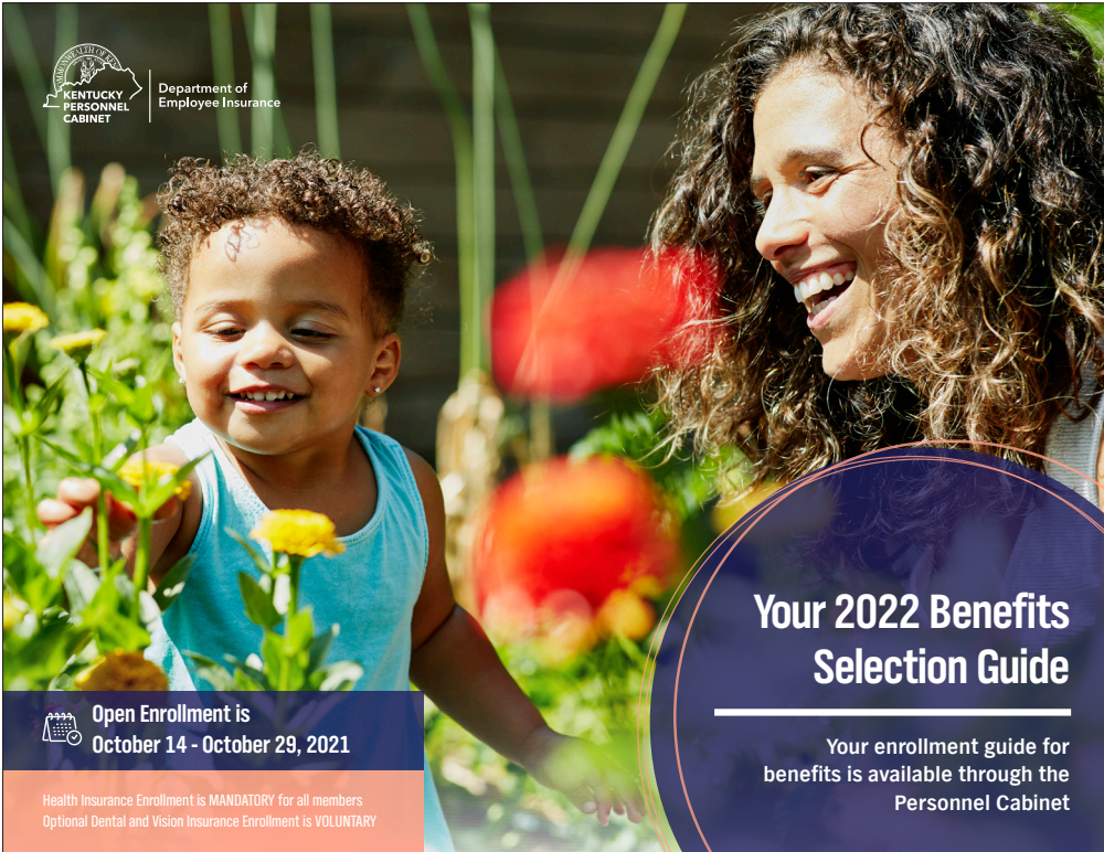
Large Benefits Selection Guide

* Color taken from the Kentucky state flag