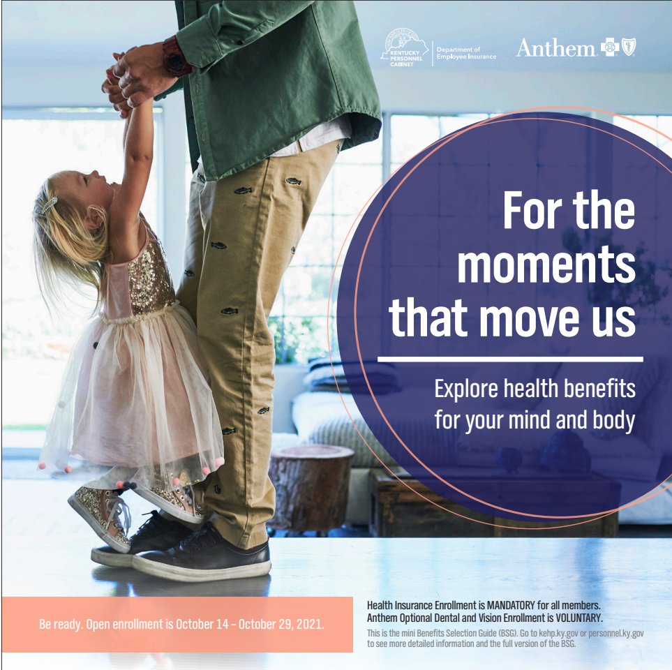
Mini Benefits Selection Guide